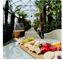
A Delicious Light Lunch