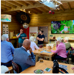
Private Interview Spaces